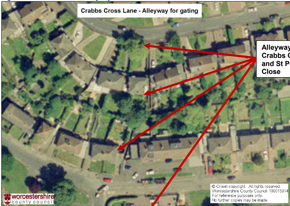
Figure 1: Aerial view of the alleyway between Crabbs Cross Lane & St Peters Close